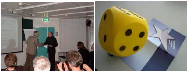
Left: Onno Boxma handing over the brochure to Emile Aarts

www.eurandom.tue.nl/CLUSTER . We expect to update these pages regularly.